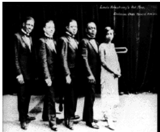
Louis Armstrong's Hot Five

This was a period of flux for the nation as a whole. WWI would push the nation into the “modern era”, new technologies were emerging - radio, talking pictures, records, and the migration from south to north (of which the New Orleans musicians were only a part) was changing the demographics of the country. With the advent of the ‘20’s, a period of economic prosperity and changing social structure was slowly remaking the face of the United States. In my mind we were evolving from a regional outlook into a national one - not overnight but slowly and steadily aided by the radio, the talking picture, the record player, and the increased ease of transportation. F. Scott Fitzgerald gave the name to this era - the Jazz Age...more a statement of attitude than music.