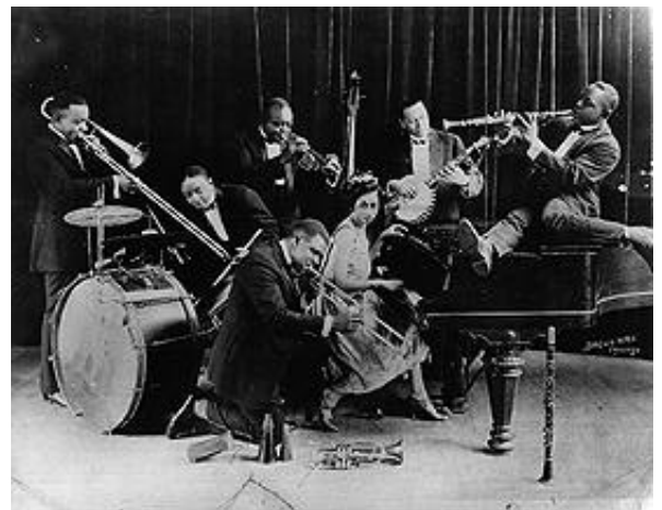
King Oliver's Creole Jazz Band

This music was evolving to adapt to different circumstances and environments. With the closing of Storyville by the Navy in 1917, the music on New Orleans fanned out across the country - not just 'up the river' to Chicago. It spread to any location that had work opportunities and transportation - Kansas City and New York. But it was Chicago which provided the easiest access. And it was the transplanted New Orleans musicians who created the style (Berendt states that Chicago Dixieland was created by young white musicians trying to copy the New Orleans players). But the New Orleans players dominated the Chicago Jazz scene early on. King Oliver lead the most