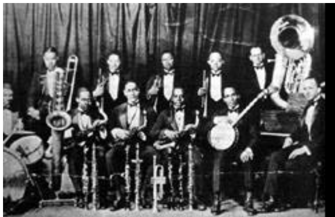
Fletcher Henderson Band

Fletcher Henderson (with his arranger Don Redman) is credited with the pattern for Swing arrangements. Originally a pianist, Henderson talent was with arranging and solving the problem with his own expanding group. He first tried an enlarged Dixieland group but with the addition of Redman (studied at the Boston and Detroit Music Conservatories) tighter harmonic control became a major interest. What he finally established as a standard was the independent use of a trumpet, trombone, sax, and rhythm sections with the incorporation of soloists within the arrangement - this was an evolution from the standard '20's dance band of 2 Tpts, 2 Saxes, 1 Tbne, and 4 Rhythm (banjo, piano, drums, tuba)